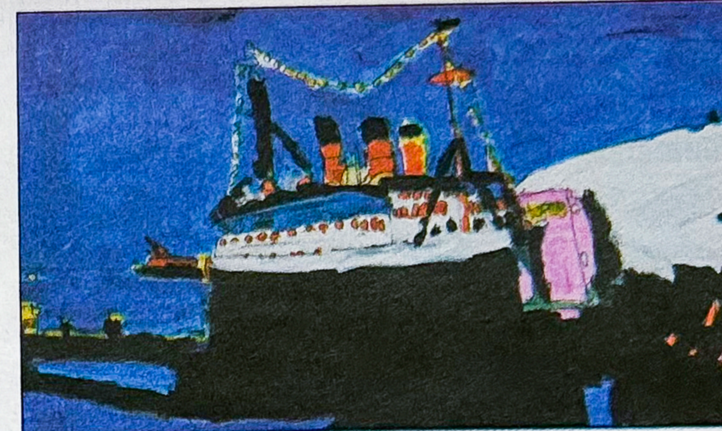
UNTITLED by Catherine Benita.