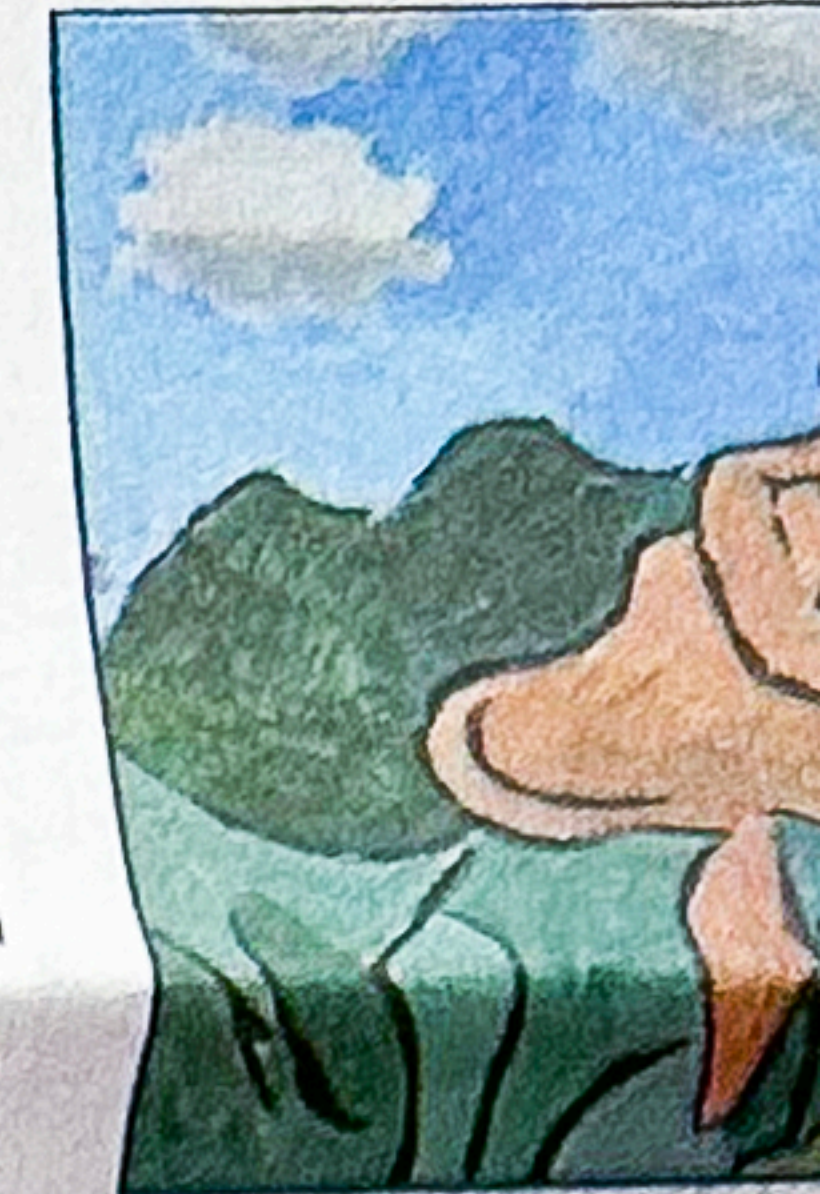
UNTITLED # cent Siso.